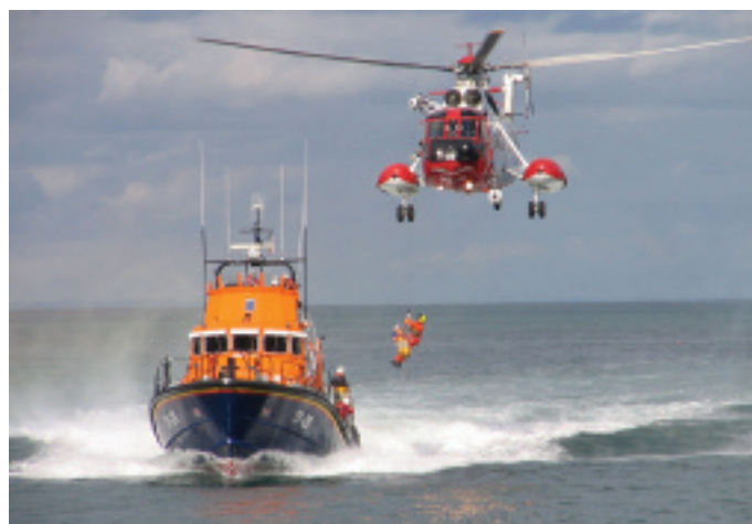
Search and rescue demonstration at Breakwater beach on Sunday 20 August 2006.