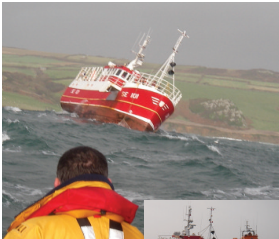
Heavy weather makes it difficult for the Emma Jane to pick up a tow.

These vivid photographs were taken when Torbay's all-weather lifeboat (ALB) was called out to take over the rescue of a 16-metre fishing vessel from Salcombe lifeboat.