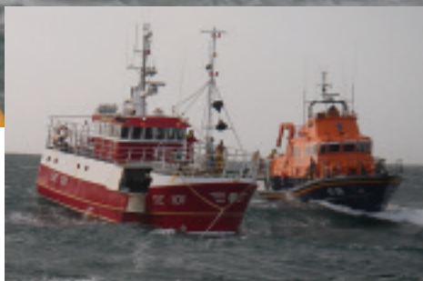
The Torbay lifeboat takes over the tow of the Emma Jane

She was taken under tow by her sister vessel near Prawle Point and the Salcombe lifeboat launched to assist them into Salcombe, however gale force conditions forced them to divert to Dartmouth.